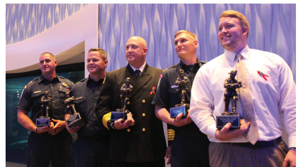
LFD honored at Ronnie Thames Foundation Ceremony