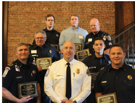
LFD honored at Valor Awards

The LaGrange Police Department and the LaGrange Fire Department were recognized at the 7th Annual LaGrange-Troup County Chamber of Commerce Valor Awards.