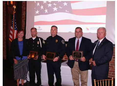
LPD honored at Valor Awards