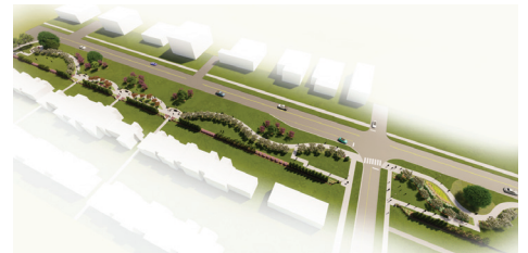
Rendering of Benjamin Hill Park along Whitesville Road

The city has committed SPLOST dollars approved by LaGrange residents to replace playground equipment in Granger Playground at Hunnicutt Place and Granger Drive. As part of the master plan, a complete redevelopment of the park is underway featuring all-new equipment, a “trike track”, a picnic pavilion, additional parking, a unique boardwalk structure, and a walking trail with direct connection to The Thread.