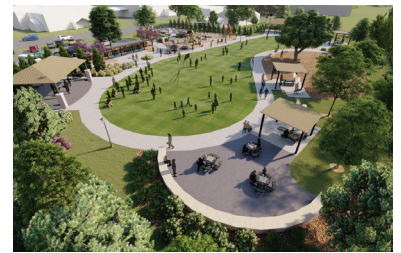
Rendering of New Park bordering Hamilton Road/Colquitt Street/Brown Street

The first park renovation project is a replacement park of the popular Union Street Park which was acquired by GDOT during the Hamilton Road widening project. The space for the new park was identified off Hamilton Road, bordered by Colquitt and Brown Streets, not far from the former park. Amenities in this new park will include a playground and fitness equipment, walking trails, a beautiful outdoor covered stage for community events, open greenspace, adult swings, pavilions, BBQ grills and game tables.