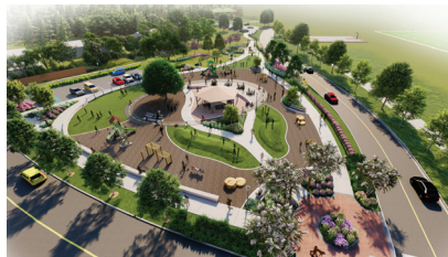
Rendering of Granger Playground

The city has committed SPLOST dollars approved by LaGrange residents to replace playground equipment in Granger Playground at Hunnicutt Place and Granger Drive. As part of the master plan, a complete redevelopment of the park is underway featuring all-new equipment, a “trike track”, a picnic pavilion, additional parking, a unique boardwalk structure, and a walking trail with direct connection to The Thread.