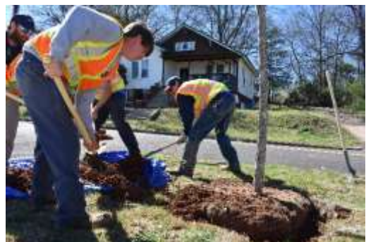
City crew planting trees