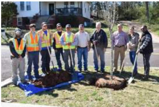
City of LaGrange representatives plant a tree in honor of Arbor Day

LaGrange, Ga. March 6, 2018 – City of LaGrange crews and dignitaries honored Arbor Day by planting a tree at the site of Southbend Park.